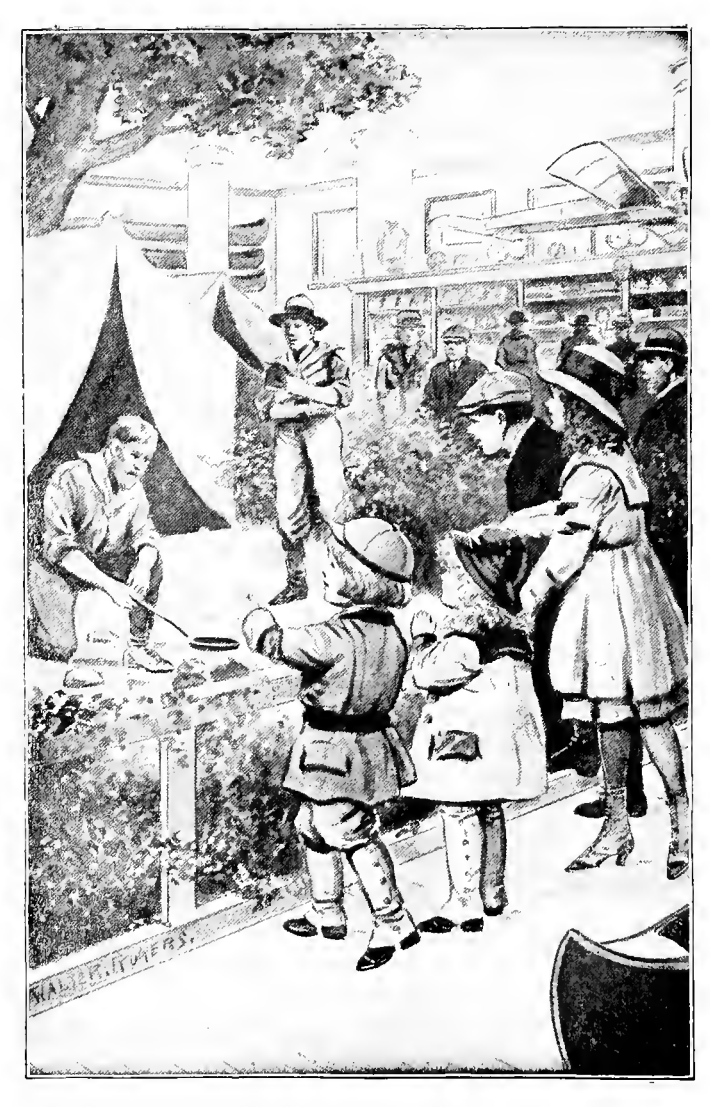
THE CHILDREN WERE DELIGHTED WITH THE STORE CAMP. The Bobbsey Twins in a Great City. Frontispiece—(Page 165)